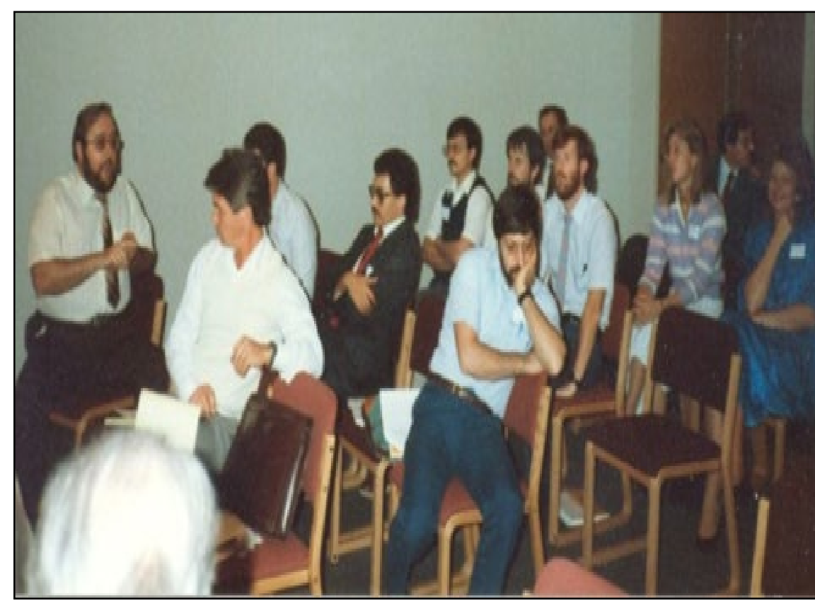
Pre-chapter days: 1985