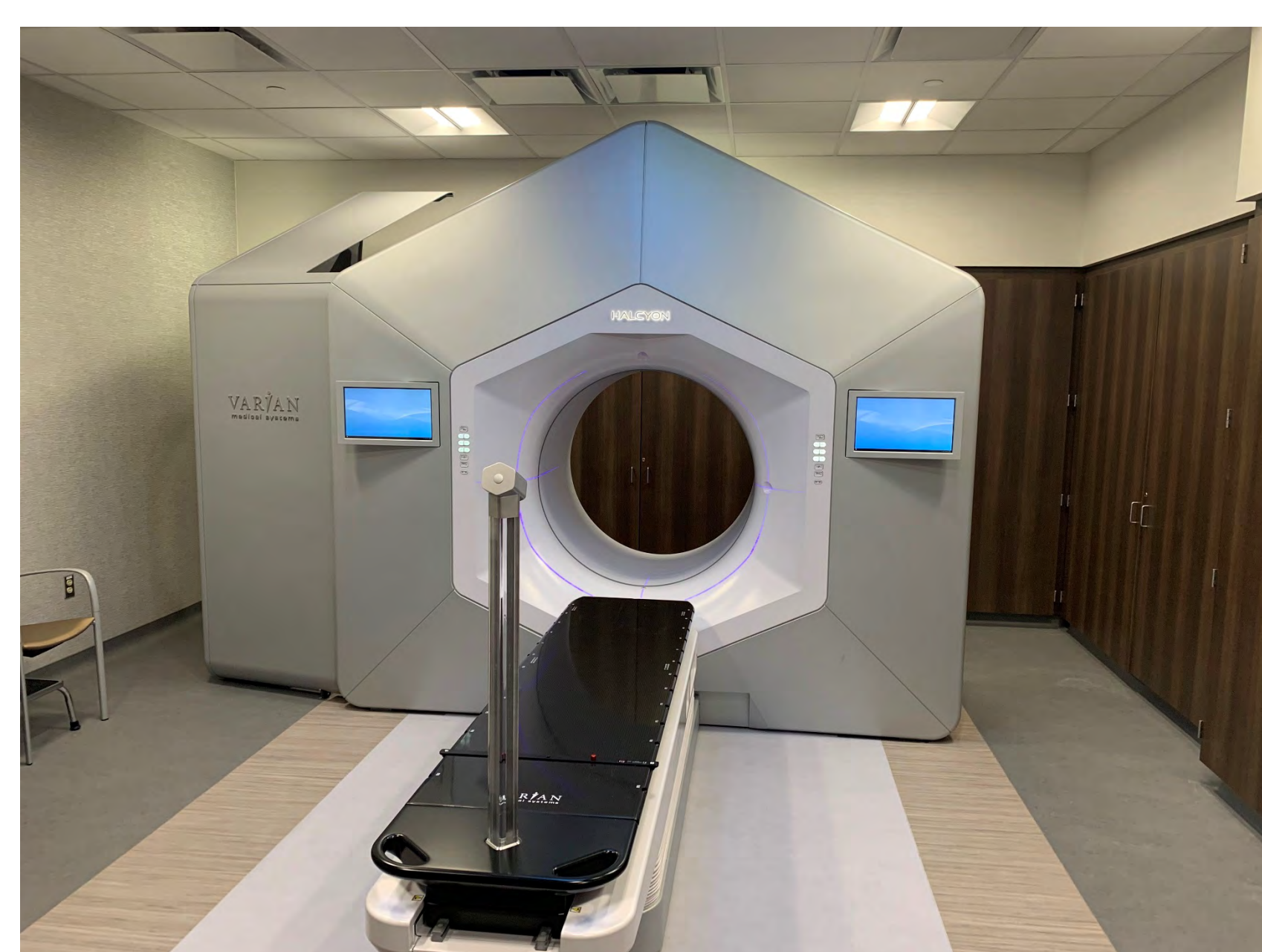
Halcyon machine of Saint Barnabas Medical Center