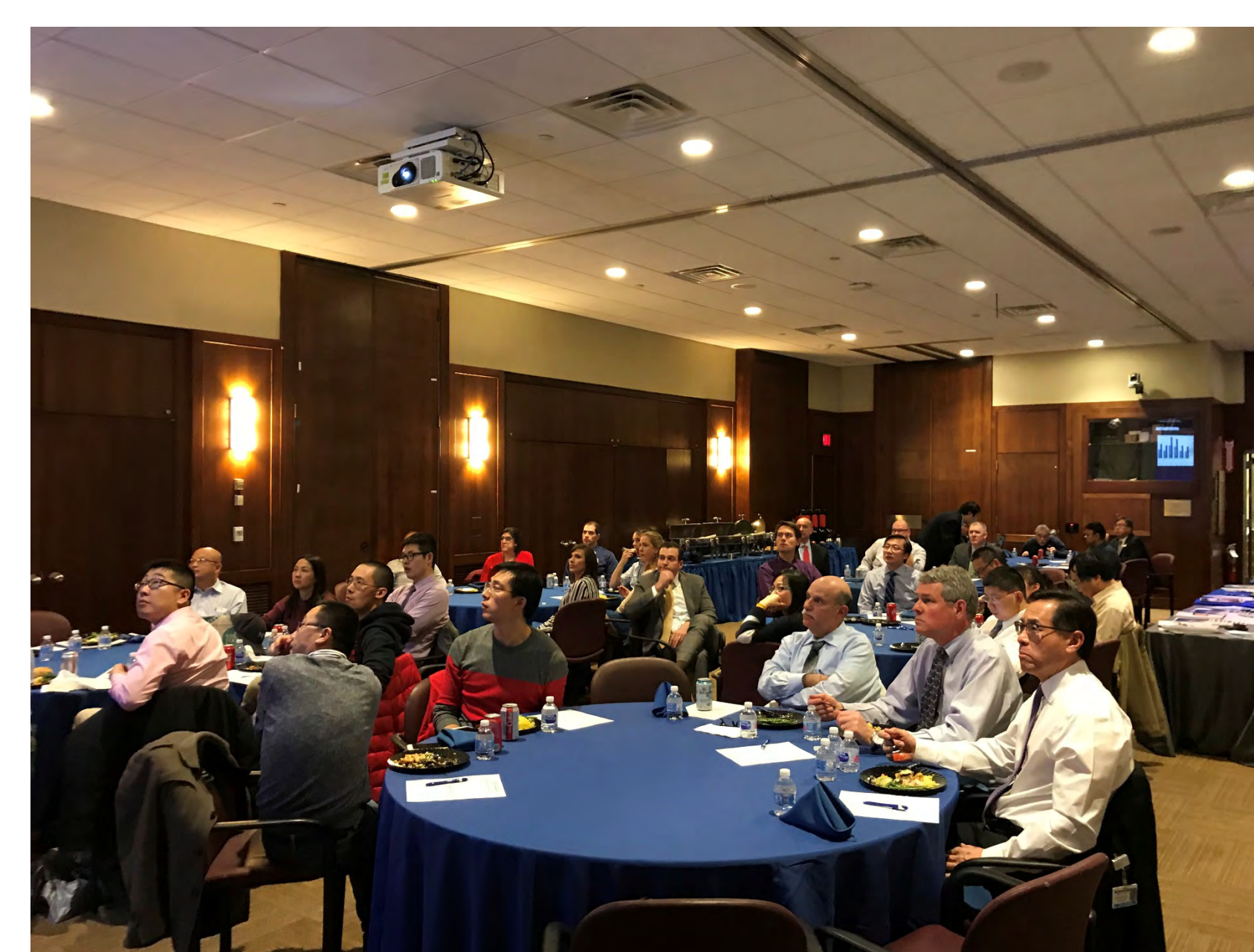
Attendees of Spring 2019 chapter meeting