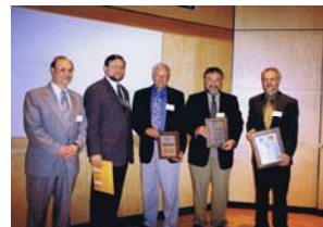
Fifth Kodak Memorial Lecture Series, 1998.