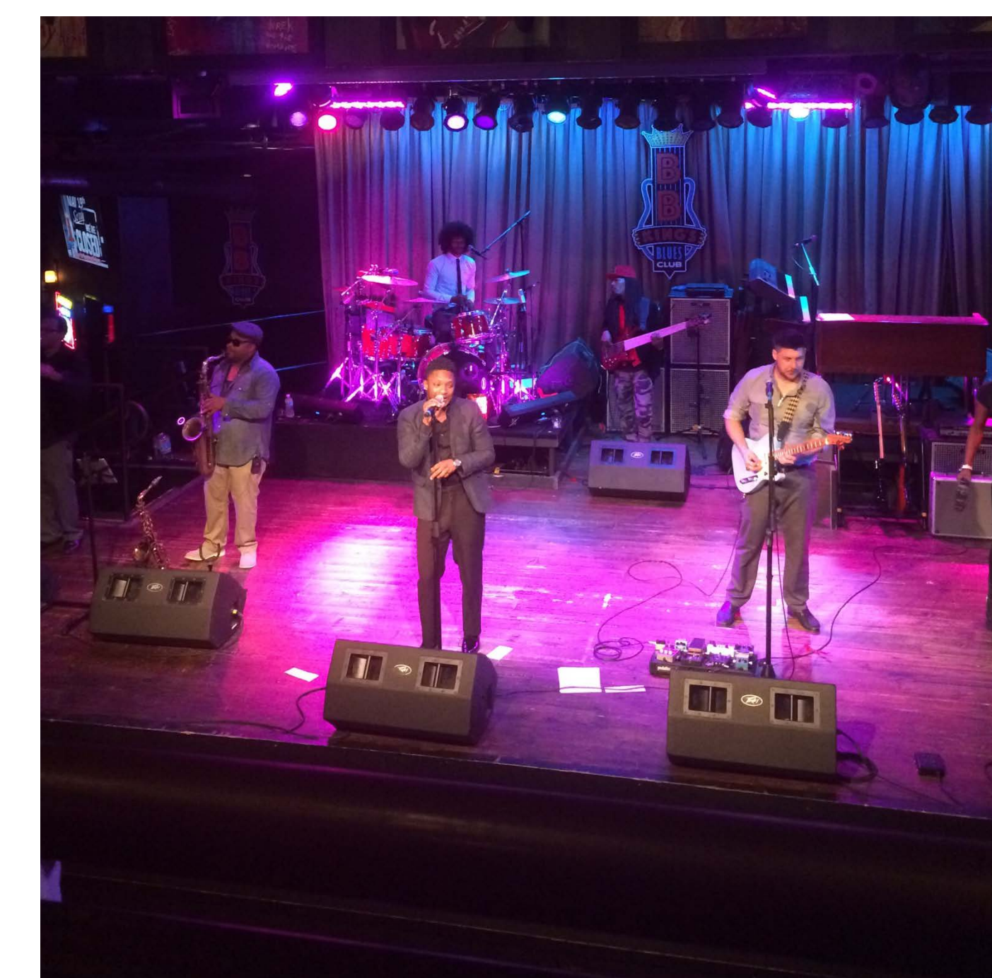
The night outs during the chapter meeting were the highlight of the social event, where members often connected professionally.