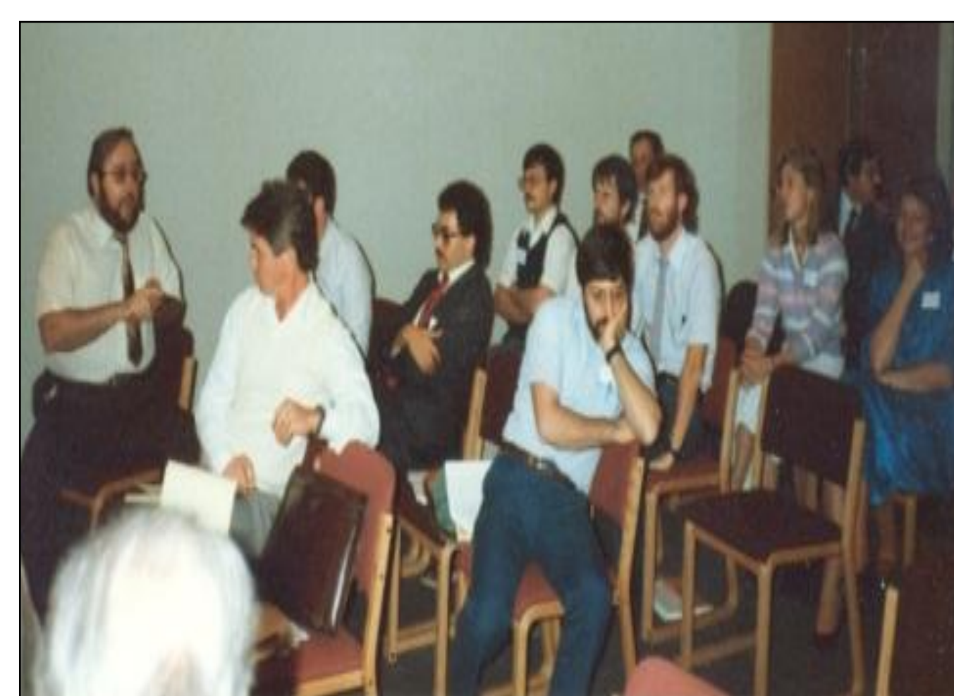
Pre-chapter days: 1985