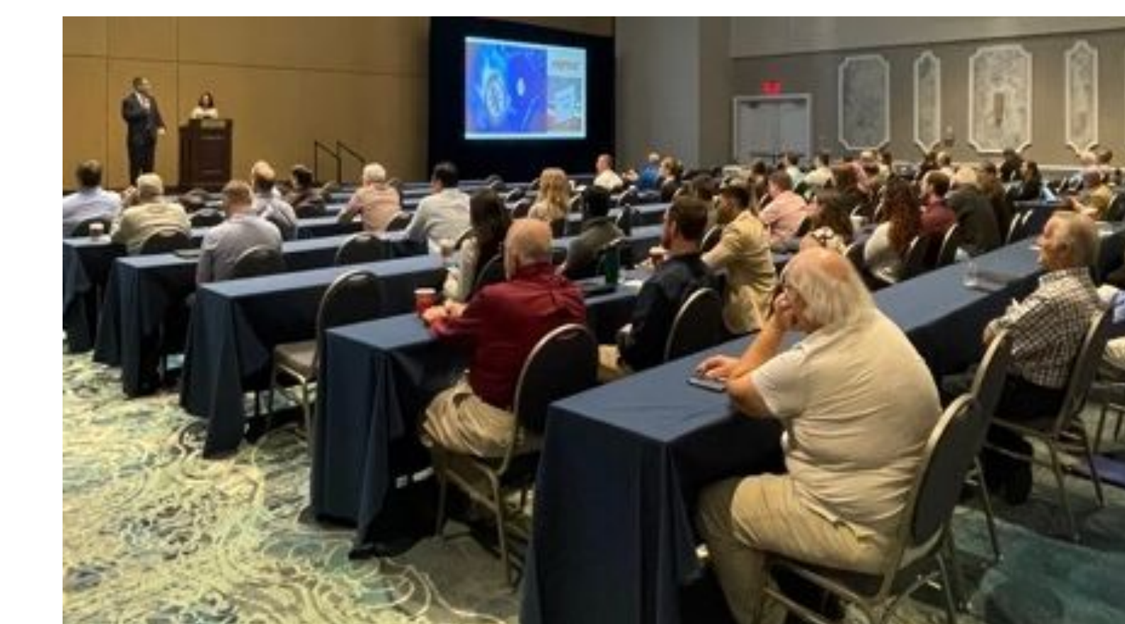
Spring 2022 Meeting