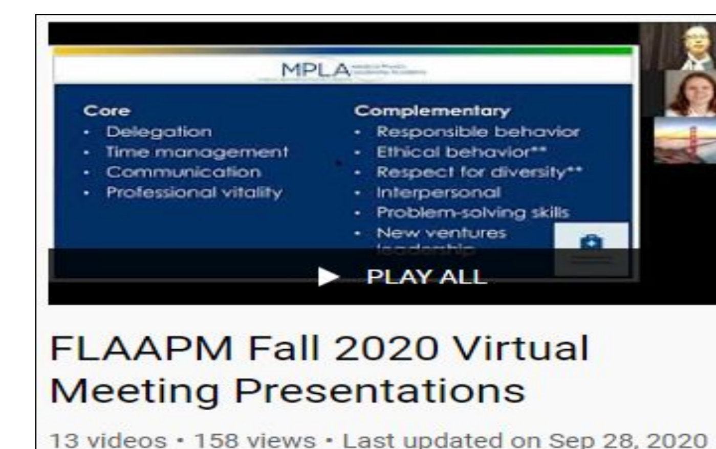
FLAAPM Fall 2020 Virtual Meeting Presentations

The rapid spread of COVID-19 in early 2020 caused a major health safety concern worldwide. The FLAAPM board decided to hold the first ever virtual meeting in Fall 2020. Due to ongoing health concerns, the Spring 2021 and Fall 2021 meetings were also held virtually and resulted in record numbers of attendees. Due to the popularity of the virtual option, and in an effort to meet the needs of all members, the chapter is poised to hold virtual fall meetings and in-person spring meetings moving forward.