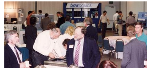
FLAAPM has traditionally enjoyed strong vendor support at chapter meetings.

The Florida chapter has grown immensely in numbers and activity from its early self. The 1.5 day Spring chapter meeting is the main meeting event of the year, generally drawing well over 100 attendees and more than forty vendors. Each Fall, a one day meeting is held jointly with the Florida HPS. In total, the chapter offers twenty license CE credits each year, including the all-important and otherwise elusive Medical Errors and HIV/AIDS credits. ABR MOC participants receive CAMPEP and SAM credits from chapter meetings. The chapter website includes SAM presentations and credits for chapter members and for a large number of out-of-state MOC participants.