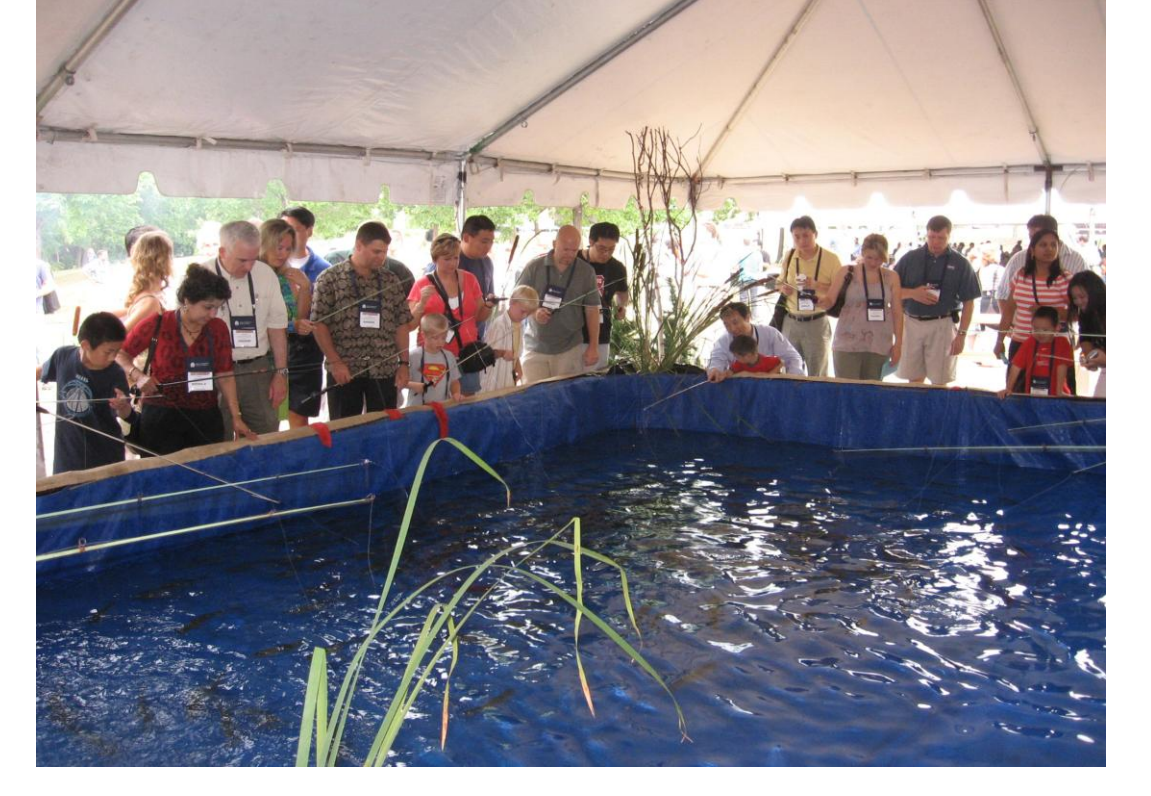
NCC/Vendor sponsored fishing pond AAPM 2007 meeting