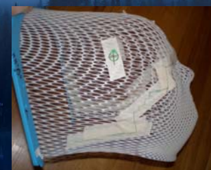
Frameless Stereotactic Localization