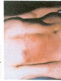
Photo 1b. Early erythema 11 days after exposure.