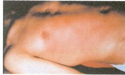
Photo 1a. Early erythema in the frontal and antelateral right side of the chest 5 days after the exposure to an iridium-192 source (185 GBq, 5 Ci) mounted in a pen-size source holder for industrial radiography, which was placed to the pocket of the worker's overall and kept there for about two hours.