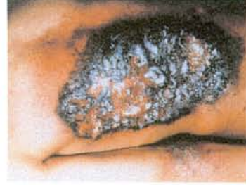
Photo 1c. Desquamation and skin necrosis 21 days after exposure. Note: the white areas correspond to silver ointment.