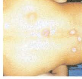
Photo 2a. An ulcer in subacute stage and five ulcers following self-healing with depigmentation caused by being unawarely exposed 4-8 months earlier to the same 164 GBq (4.4 Ci) cesium-137 source (placed in a pocket of a trench coat used as a blanket).