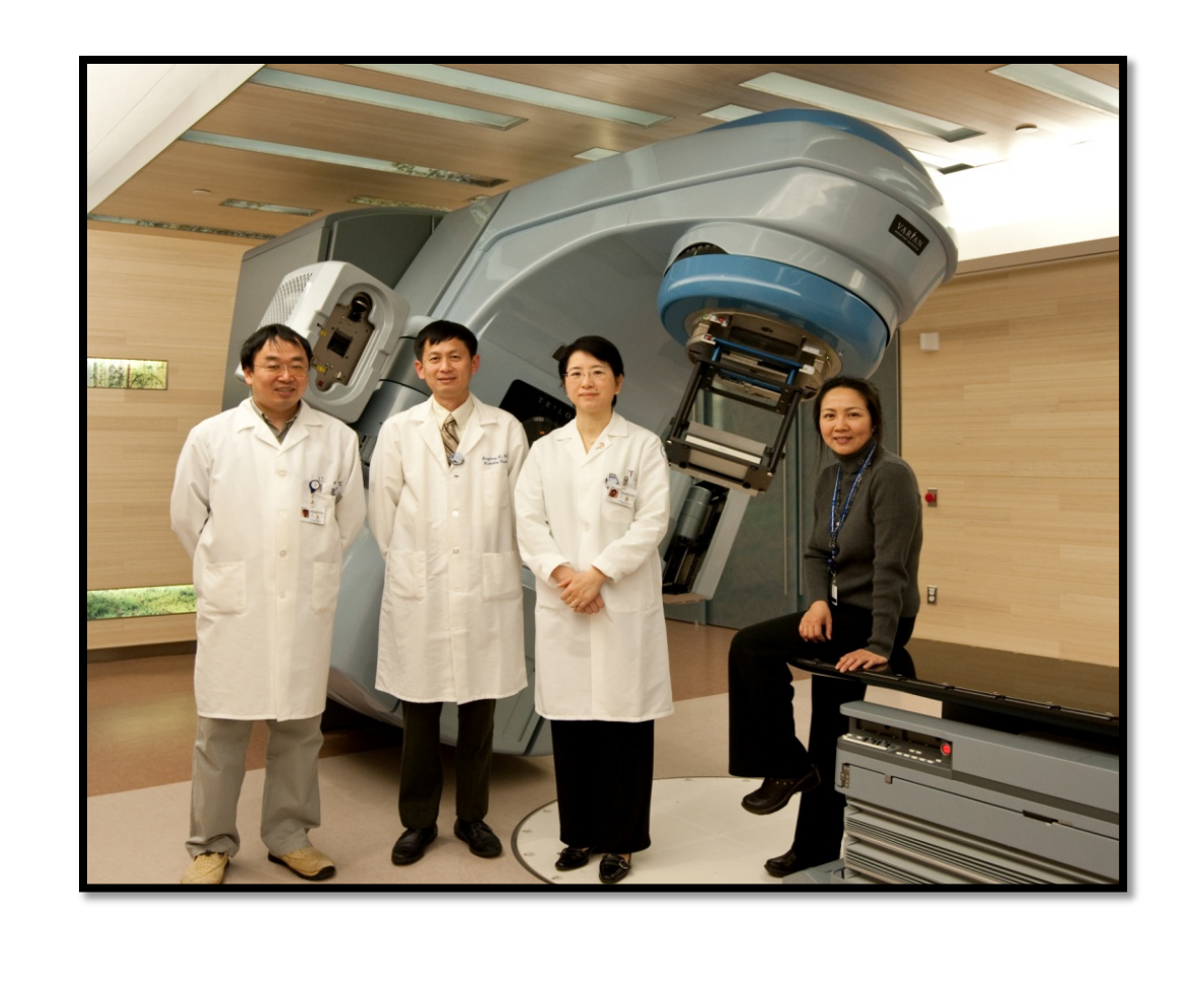
Physicists at Memorial Sloan-Kettering Cancer Center, Basking Ridge, NJ.