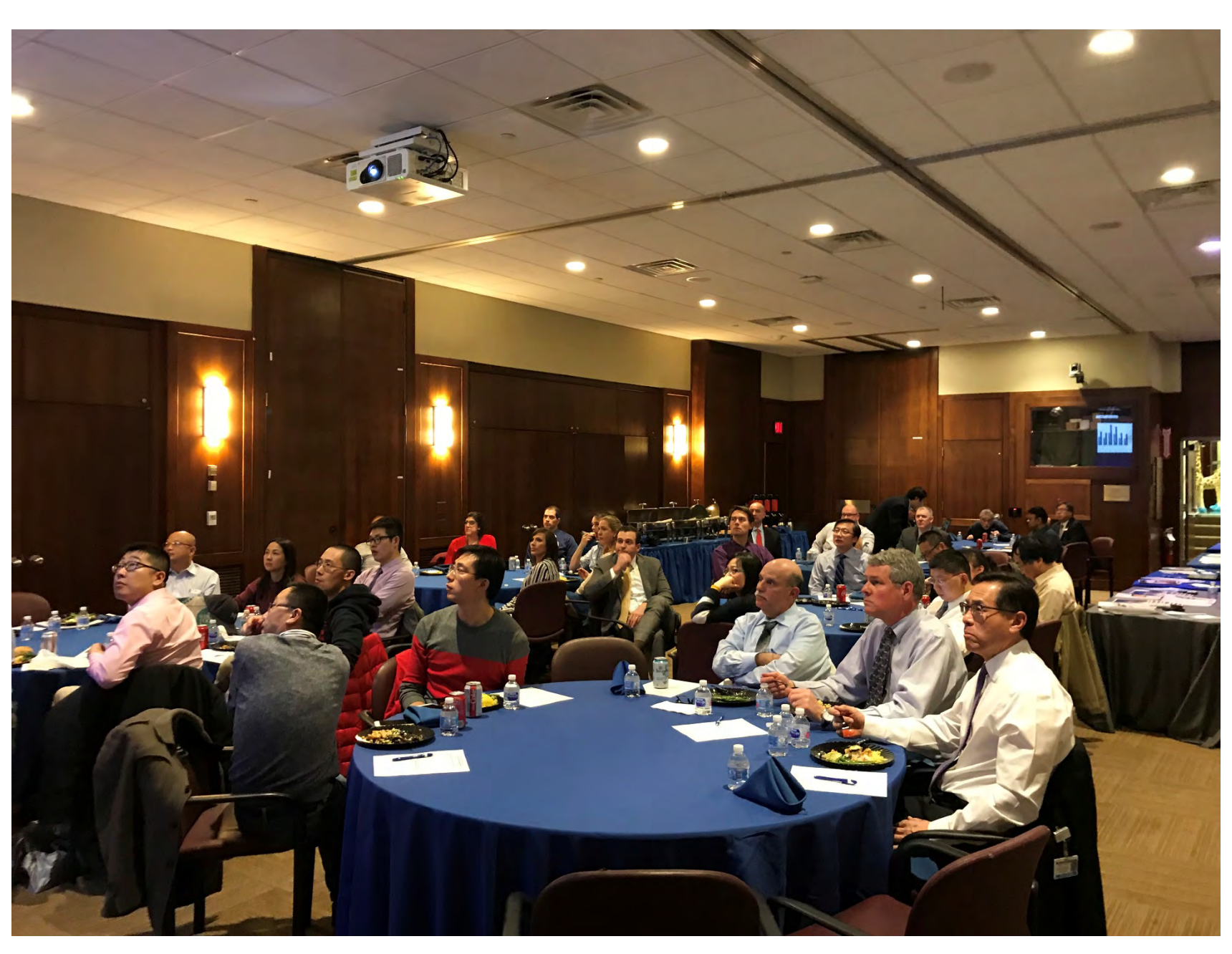
Attendances of Spring 2019 chapter meeting