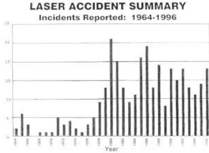
Diagram 1. Laser Accident Summary: Incidents Reported (1964–1996)

Laser hazards involve exposure risks to the eye and skin, as well as fires, electrical system faults, and emission of fumes/toxic substances.